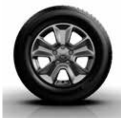
16" 'Tyrol' alloy wheels