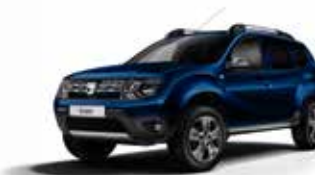
Cosmos Blue (RPR)