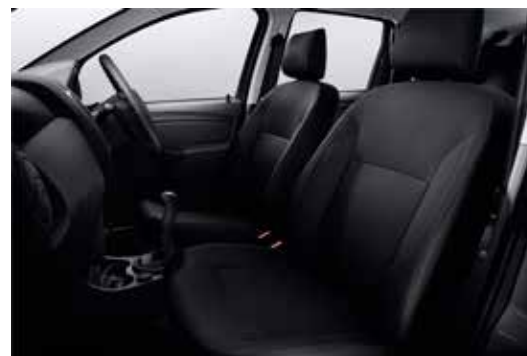
'Bainite' cloth upholstery