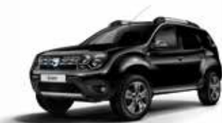
Pearl Black (676)