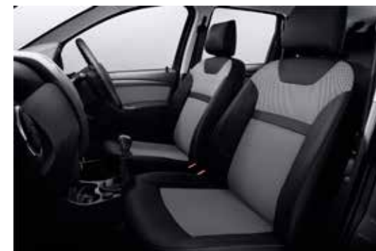
'Graphite' cloth upholstery