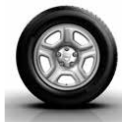
16" 'Sierra' steel wheels