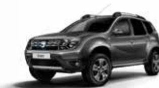
Slate Grey (KNA)