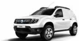
Glacier White (369)