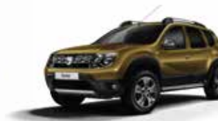
Pennine Green (DPC)